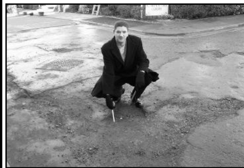
George St before road improvements